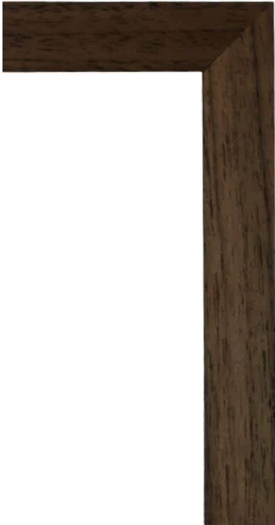
Gallery Dark Natural Walnut