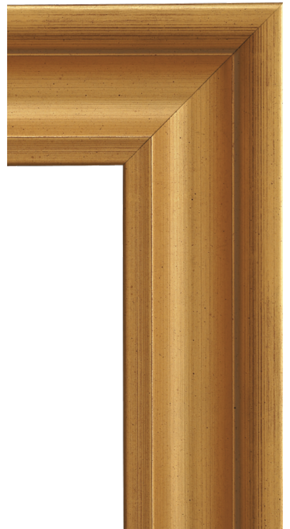
Wide Antique Gold