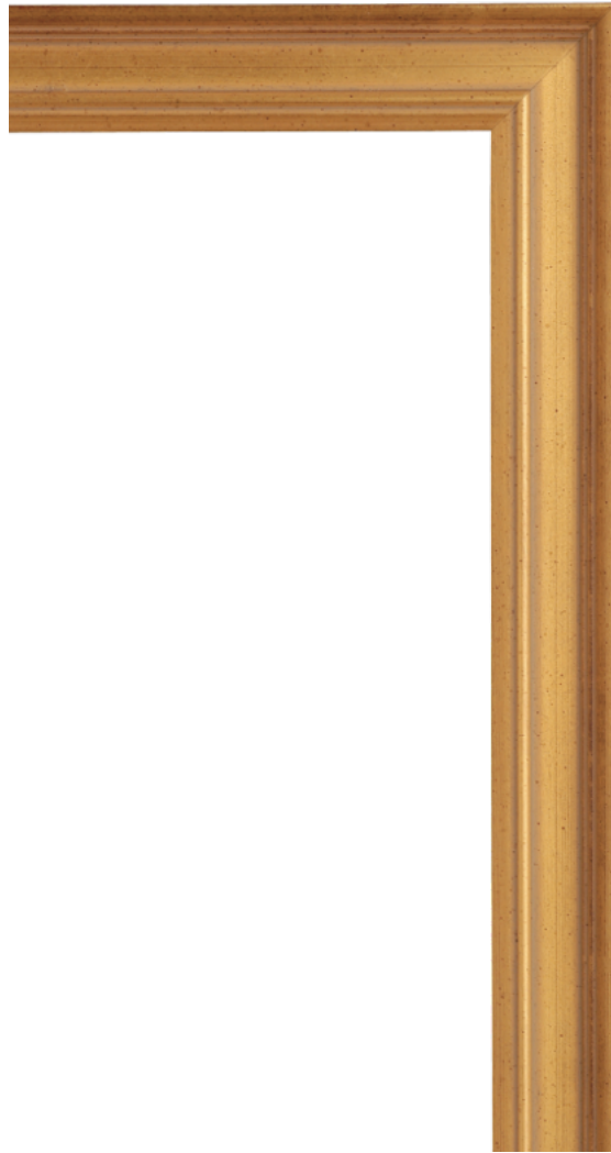
Medium Antique Gold