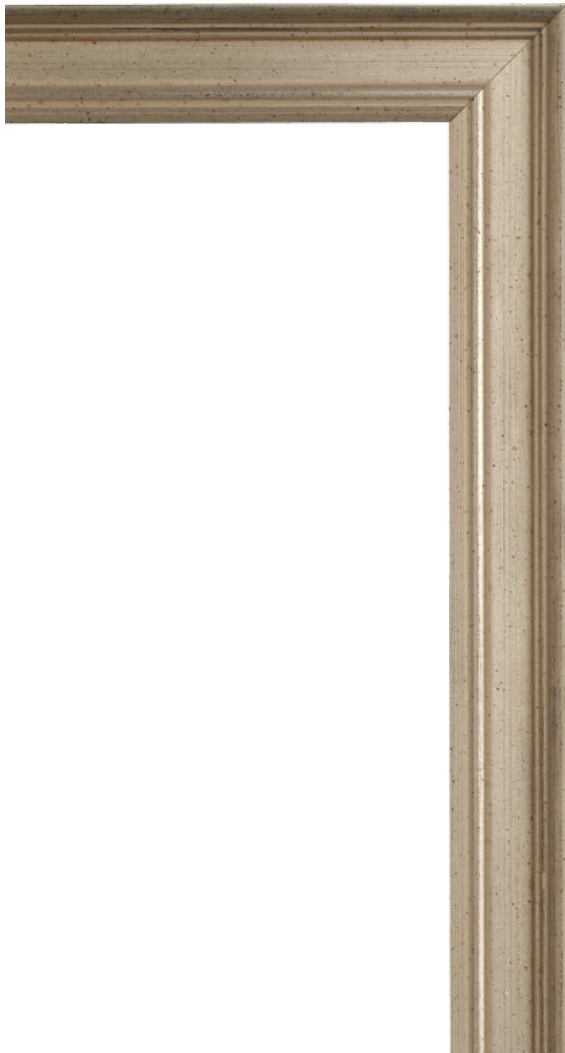
Medium Antique Silver