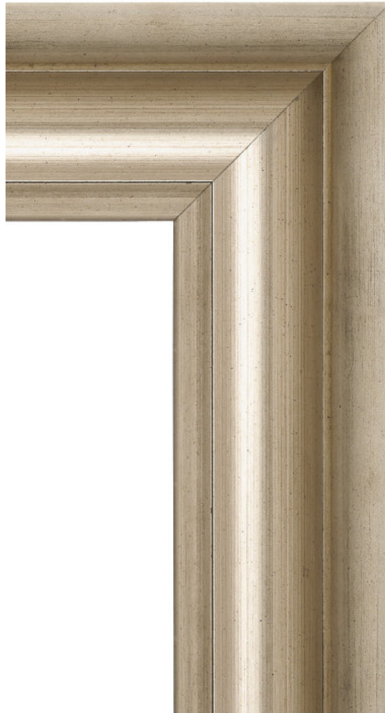
Wide Antique Silver