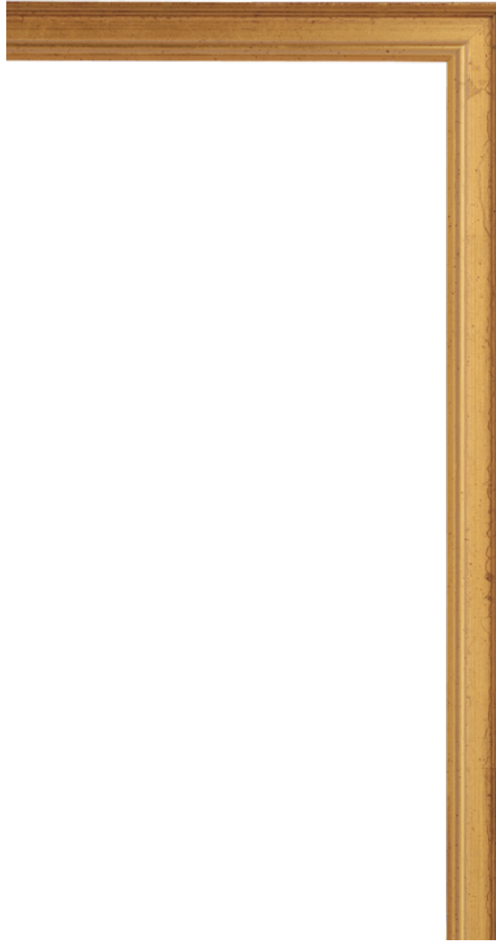
Thin Antique Gold