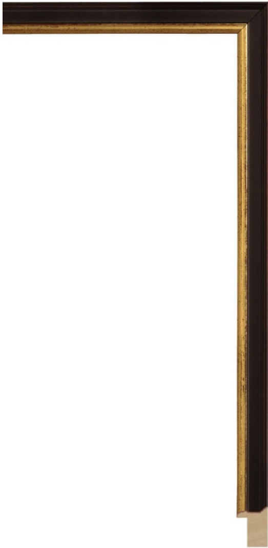
Thin Black (Gold Trim)