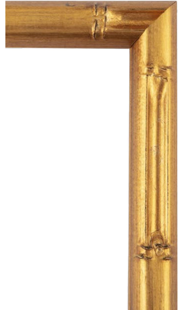
Thin Gold Bamboo