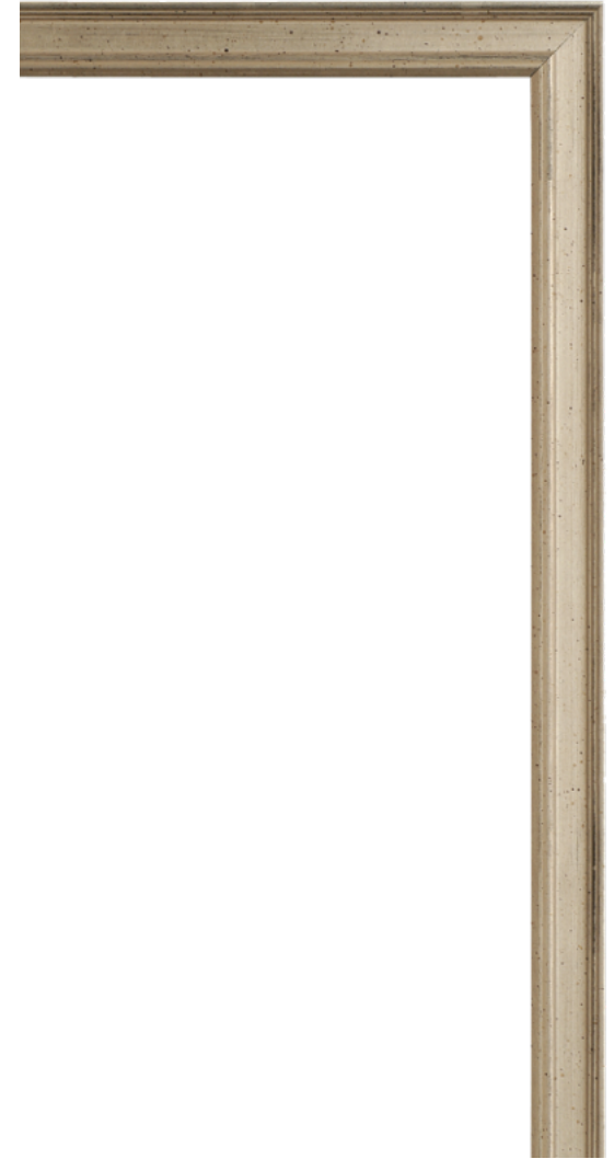
Thin Antique Silver